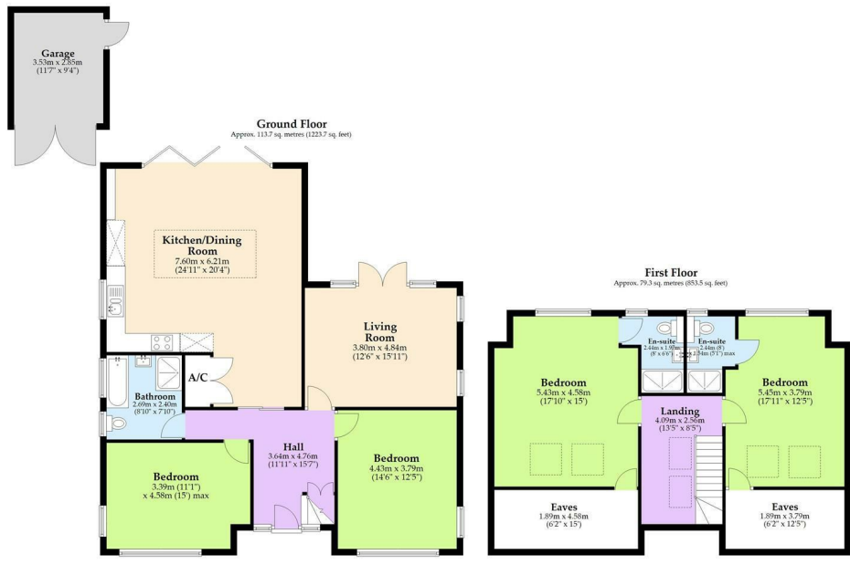
Total area: approx. 193.0 sq. metres (2077.2 sq. feet)